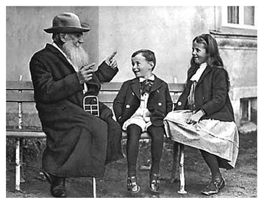
Figure 4 L. N. Tolstoy telling the story of the cucumber to his grandchildren, S. A. and I. A. Tolstoy. Kryokshino, Moscow province, 1909.

Yet human beings do repeat these behaviors, and just as the old woman falls from the bean stalk, so too Ivan falls from the ladder while showing the upholsterer where to hang the drapes. In both cases, the imagined heaven proves illusory. Like a fly lulled to its death by a beautiful light, Ivan is drawn in by the glitter of a familiar mediocrity: "In reality it is just what is usually seen in the houses of people of moderate means who want to appear rich, and therefore succeed only in resembling others like themselves: there were damasks, dark wood, plants, rugs, dull and polished bronzes—all the things people of a certain class [sort] have in order to resemble all other people of that class [sort]" (99, 3).