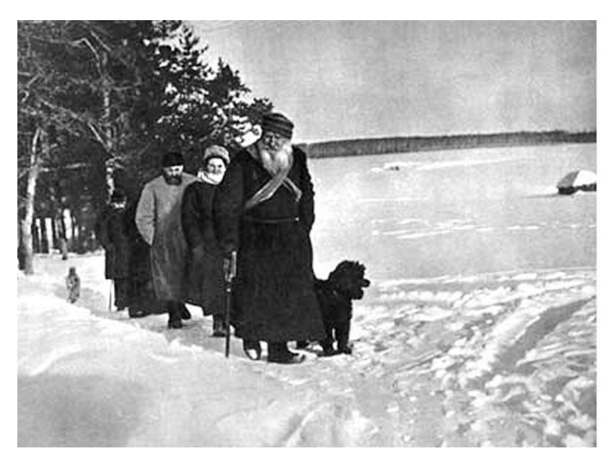
Figure 2 L. N. Tolstoy, A. L. Tolstaya, D. P. Dolgorukov, and P. I. Biriukov going to Yasnaya Polyana village to attend the inauguration of a rural library. Yasnaya Polyana, 1910.

ing the world's pain, imbibing its pleasures, and embracing its possibilities as few other characters do.<sup>6</sup>